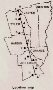
Figure 2 Stratigraphic and Hydrogeologic Section A-A'